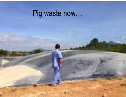
Pig waste now...

People used to think and believe the authority was the parents and the people were the children. The parents would take good care of their children. Children do not need to complain but the parents would seek to understand what is best for the children. Sometimes it is not the way people think.