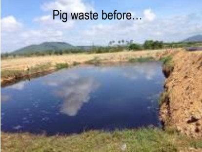
Pig waste before...