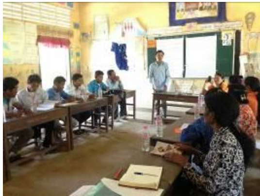
Some activities when he joining trainings and meetings.