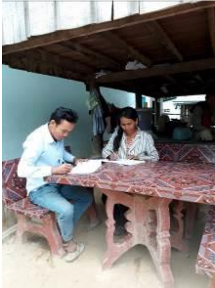
He is auditing VDA saving and visiting farmer.